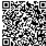
QR Code: 14 Iowa Wildlife Tracks