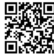
QR Code: Poison Ivy Identification