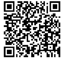
QR Code: Map of trails