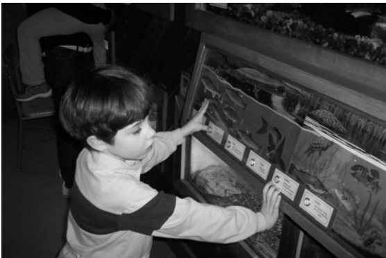
Visitors eager to learn at one of the many Exhibits in the center!

We have not confirmed all of the programs for the summer season at this time. Please contact the park office for updates or visit www.minesofspain.org for listings.